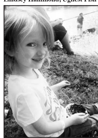
Eating dessert at the fishing derby Lake Nottely Fishing Charter; Leon Farmer Company; Majestic Mountain Property; Mike's Seafood; Nelson's Ace Hardware; Paradise Bait and Tackle; Rick's Rental; Rose Auto; Sav-A-Lot; Service Plumbing; Sundance Gallery.

S.Ā.F.E. is a 501(c)3 non-profit organization that provides services to Sexual Assault and Child Abuse Victims in Towns and Union Counties. For information on available workshops or to volunteer for S.A.F.E. please contact (706) 379-1901. If you are a victim of Domestic Abuse or Sexual Abuse or if you know someone who is, call S.A.F.E. for confidential assistance 24 hours a day. NT(May29,Z23)CA